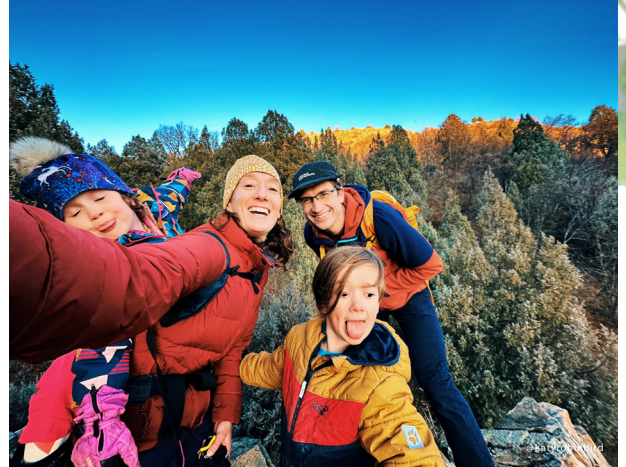
Vitamin N participants pose for a selfie while on a sunset hike.

This annual Vitamin N Challenge is part of our Families Together in Nature initiative , which serves both longtime users of our online resources – and the more than 30,000 people who find us each month as they search the web for ways to get their families outdoors. In 2024, we hosted three family-focused webinars on nature connection strategies for more than 1,000 total registrants.